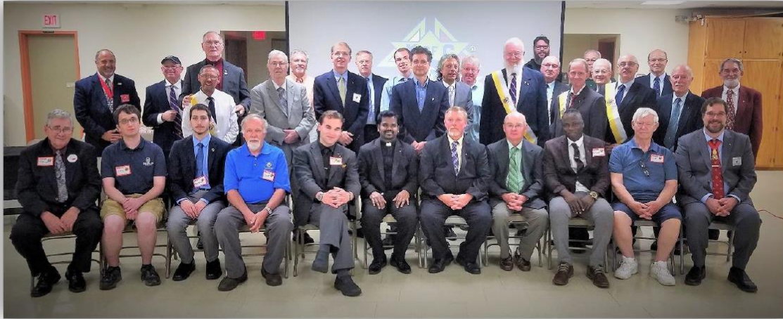
PICTURED ABOVE: Front Row Sitting – New Members;

2 nd Row Standing with Yellow Sashes – 3 rd Degree Team; 2 nd and 3 rd Rows Standing – Guests